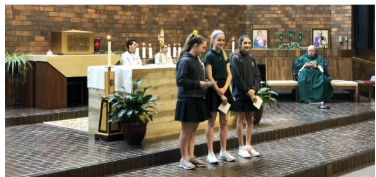
All three 8 th grade winners with their awards.